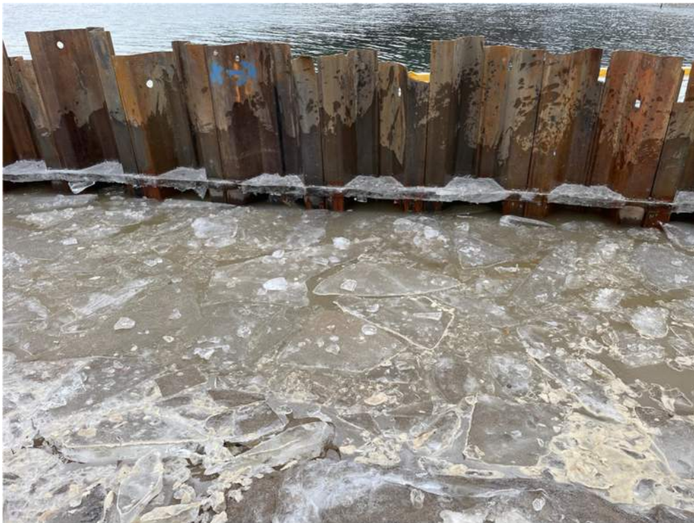
Photo #1: Water level lowering from dewatering - Nov 27, 2023, 10:08 AM