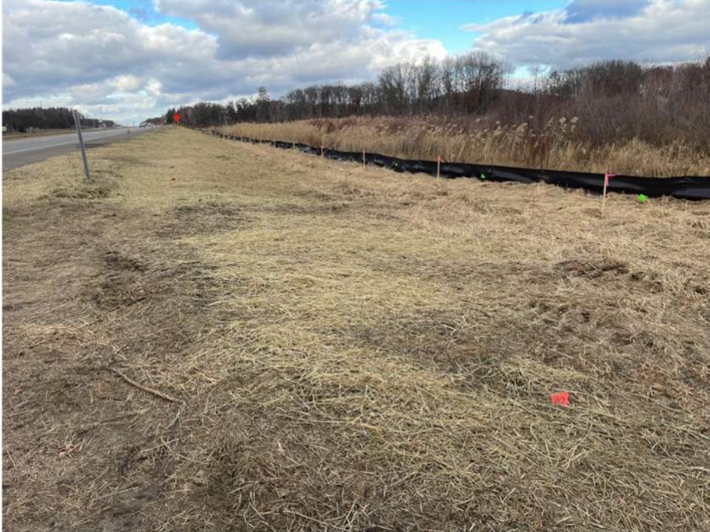
Photo #8: Straw spread over seeded area alongside Highway 10 - Nov 30, 2023, 12:40 PM