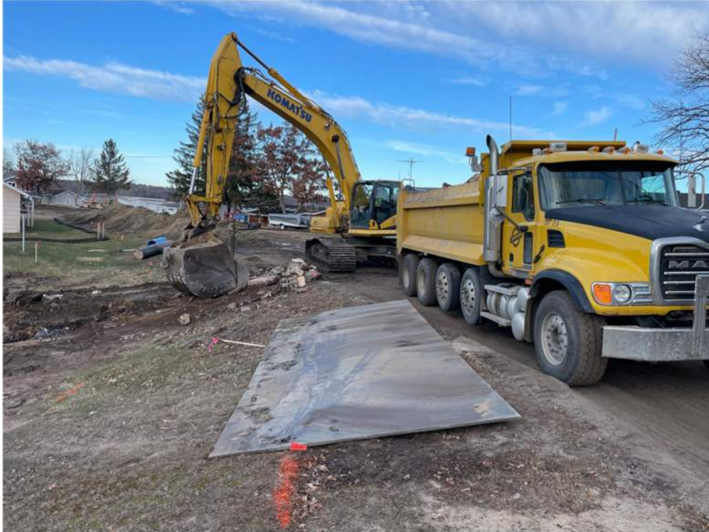
Photo #6: Removing the remainder of the fish cleaning shack - Nov 29, 2023, 3:15 PM