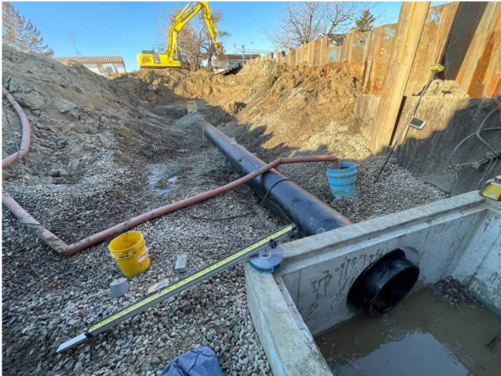
Photo #7: First section of inlet pipe installed - Nov 30, 2023, 10:33 AM