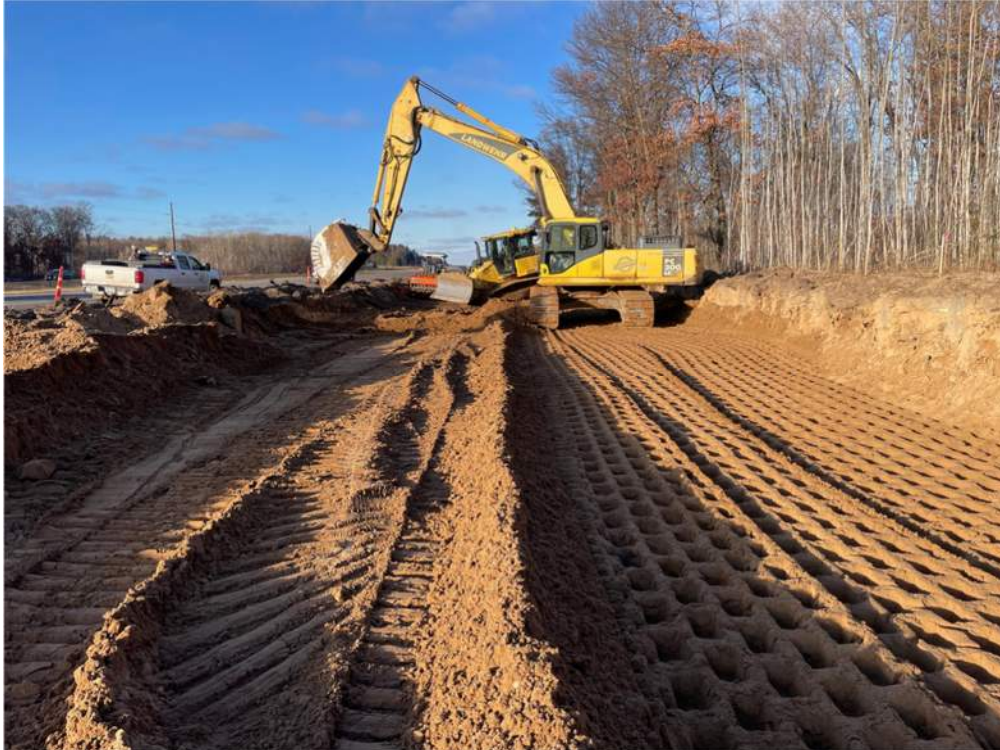
Photo #2: Dozing and backfilling over installed force main along Highway 10 - Nov 27, 2023, 3:10 PM